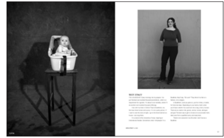
▲ Pages from The Oxford Project .