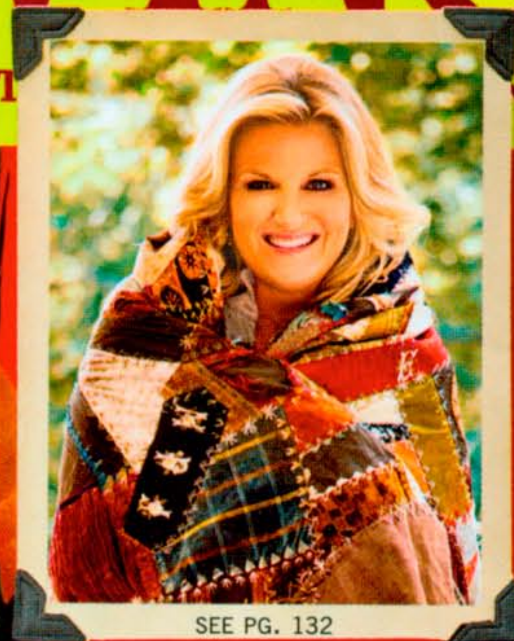
SEE PG. 132